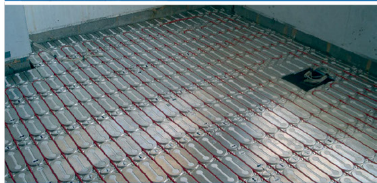
Insulated Heating Panels for Under Floating Floors