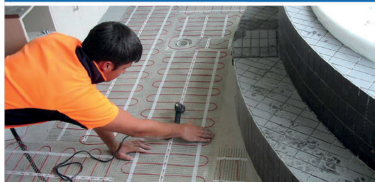
Embedded in Tile Adhesive